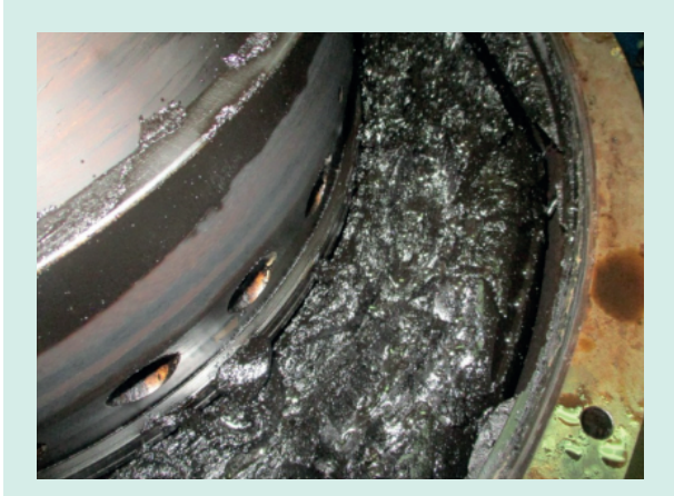
Figure 1. Aged distillates blocking up sludge lines and purifiers; if not removed, this sticky substance can become impregnated with other impurities such as cat fines or sediments, effectively creating a grinding paste inside fuel lines.

Other processes include polymerisation – if high concentrations of olefins (alkenes) are present in the fuel then this type of reaction can occur. Olefins form in refinery cracking processes and if these refinery streams are utilised in the fuel blending then polymerisation can occur. These can initiate a chain reaction that continuously form polymers that are insoluble in the fuel and form large amounts of gums and sediments. These gums and sediments can block fuel filters and form deposits on fuel injectors that ultimately cause operability issues.