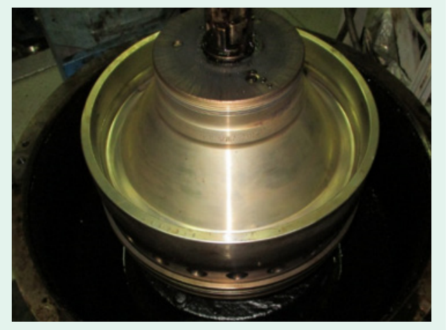
The purifier on the left experiencing severe sludging issues (required cleaning every few hours) at the recommended purification temperature, while the purifier on the right is the same purifier using the same VLSFO just twenty-four (24) hours after applying Octamar™ HF-10 PLUS.

VLSFO treated with Octamar<sup>™</sup> HF-10 PLUS