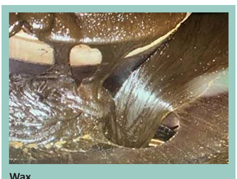
n-paraffin wax crystals separating in fuel due to lower temperatures