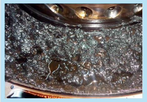
Distillate Distillate aging, polymerisation and fuel instability